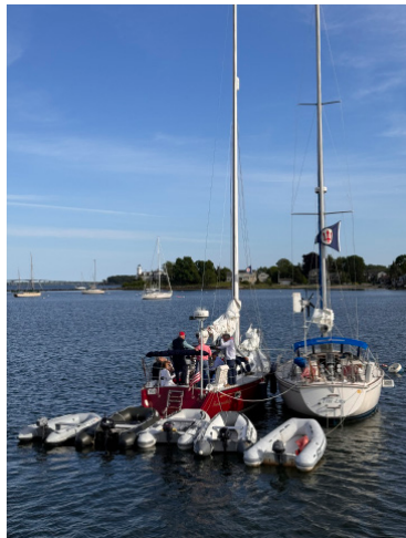
Rafting Up in Wickford