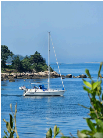
Leaving Quisset Harbor, MA