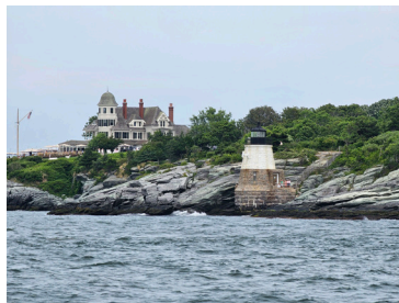
a view of Castle Hill sailing from Cuttyhunk to Newport