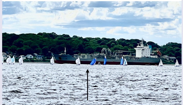
Look very closely and you can see the mark at the tip of the arrow

BYC members helping US Sailing run the U.S. Youth Championship Regatta that was held recently: "I love it when you hail the tanker coming down the bay heading for the middle of the fleet and the captain says "I see your weather mark, I'll go around it."